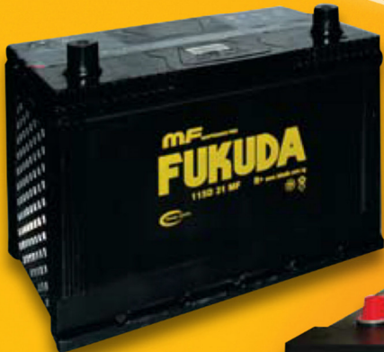
115D 31 MF